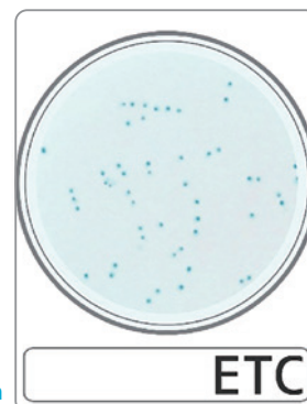
MYP agar medium