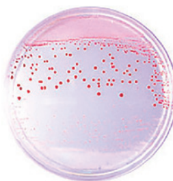
VRE (Vancomycin Resistant Enterococci)

Currently, most countries prohibit using Avoparcin, however, the VRE is still existing in poultry, and it is thought to be in chicken meat, sometimes.